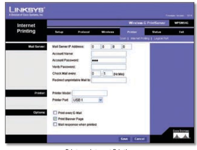
Printer > Internet Printing

Internet Printing allows you to automatically print any e-mails that are sent to a specific e-mail account on your network. This is especially useful for printing information when you are not connected to the network. You can print from any location where you can access e-mail.